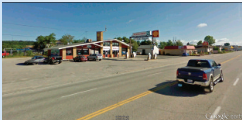
Google Street View shows an area of the project as it appears in google street view.

The safety of survey crews has always been an important aspect of completing any survey within a road right-of-way. Traffic control and signage can mitigate risk and keep workers safe; however,