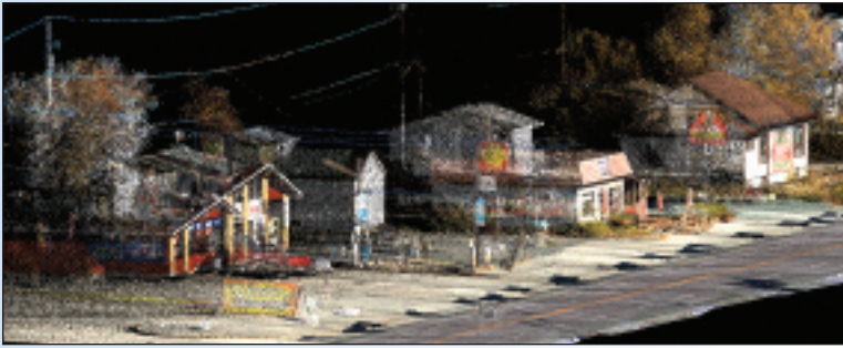
RGB PC shows the colourized point cloud

target validation points are set every 250 meters along the road corridor, surveyed conventionally, and then compared to the LiDAR data. The intent of this QC process is to demonstrate that the LiDAR data is consistently below the required 2cm accuracy level, both horizontally and vertically. Additional cross-sectional audit data is captured using total station methods every 500 metres to further demonstrate that the LiDAR data is consistently below the required 2cm accuracy level. In the event that the collected LiDAR data does not match the validation points to the desired specification, it is also possible to perform an adjustment on the data, which will hold the validation points as fixed reference points and adjust the point cloud to fit these points. This is typically required when there is a control bust with