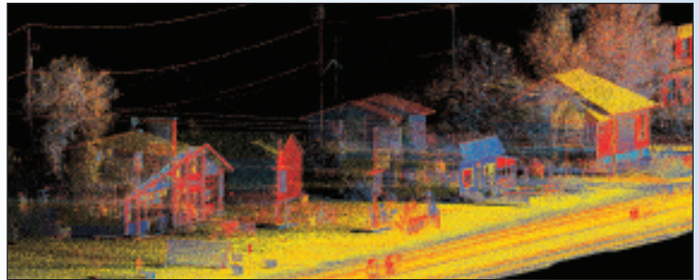
Colored Intensity PC shows the colour intensity point cloud

Once the accuracy of the point cloud is confirmed, feature extraction can commence. From the highly accurate geo-referenced LiDAR point cloud, highway features (crown, edge of pavement, edge of shoulder, rock cuts, etc) can be extracted. The digital imagery is also used to map RGB colour values onto the LiDAR points to produce a colourized point cloud in addition to the more common signal intensity view, which displays colours based on the intensity of the returns. LiDAR analysts use a combination of different point cloud views (top down, cross section, 3-D orbit, colour intensity, and RGB colourized points) and digital imagery to interpret, extract, and classify the data. Similar to conventional