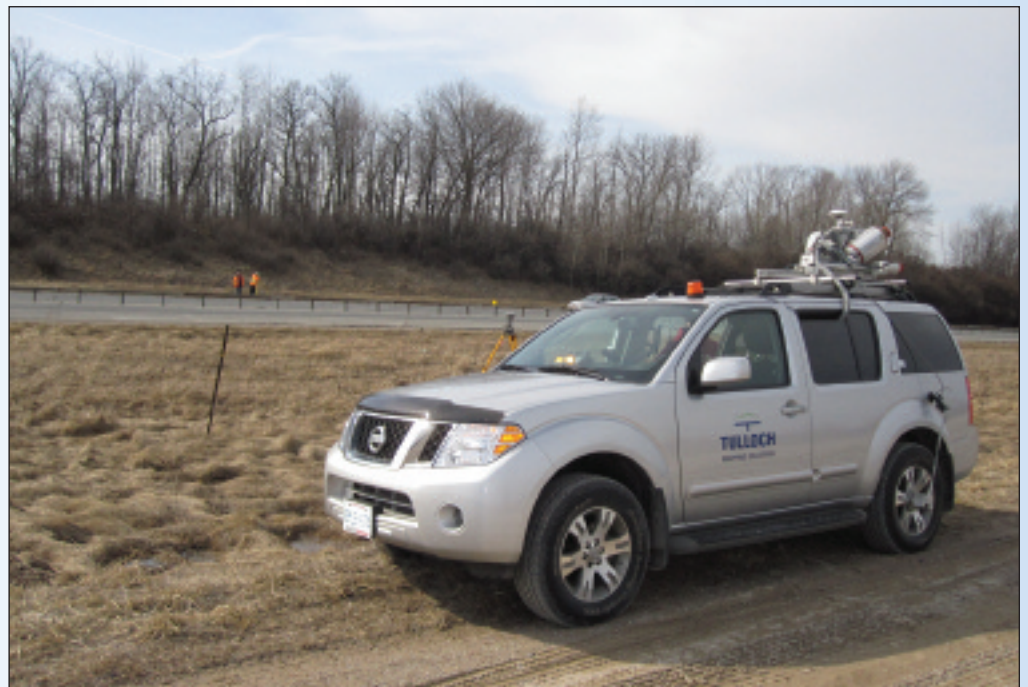
The vehicle mounted MLS system